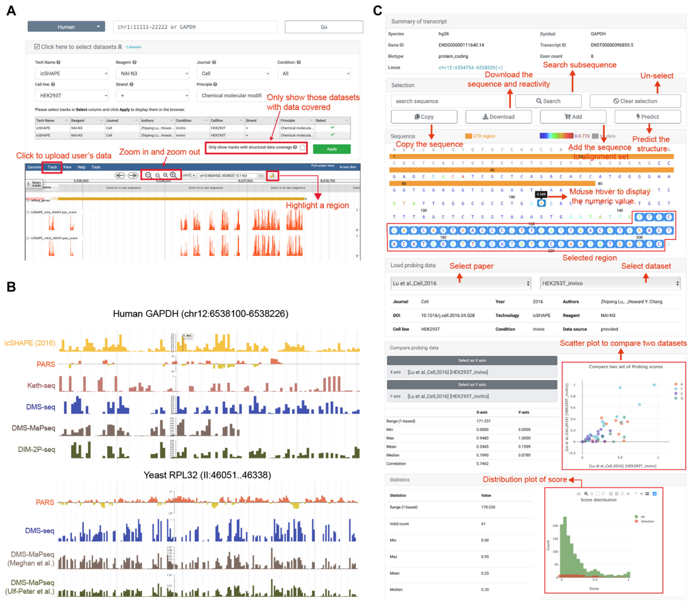
Figure 4. Structural score visualization. (A) Browser page. (B) Structure scores of the GAPDH and RPL32 transcripts. (C) Visualize the structure score on a transcript with nucleotides colored by the scores. Users can select a sequence region to copy scores, download data, or predict structure. In ‘Compare probing data’ panel, users can compare two datasets by a scatter plot. The structure score distribution is displayed in ‘Statistics’ panel.

Clicking the ‘Submit’ button returns a page with the predicted structures (Figure 5D). ‘Summary of query information’ panel contains input sequences, constraints and parameters. ‘Prediction results’ panel present a list of predicted structures ranked by free energy. Users can visualize structure with forna (32) by clicking the ‘Go’ button, or copying a java command to visualize the structure with VARNA (33).