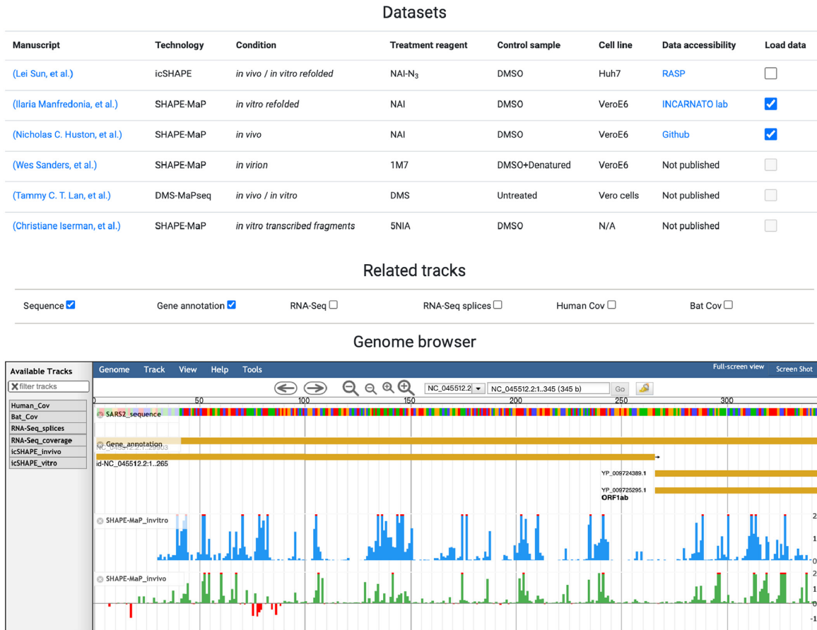
Figure 6. A special page for the secondary structure data of the SARS-CoV-2 RNA genome.

erate RNA structure research, as well as allow follow up on more data from current large datasets.